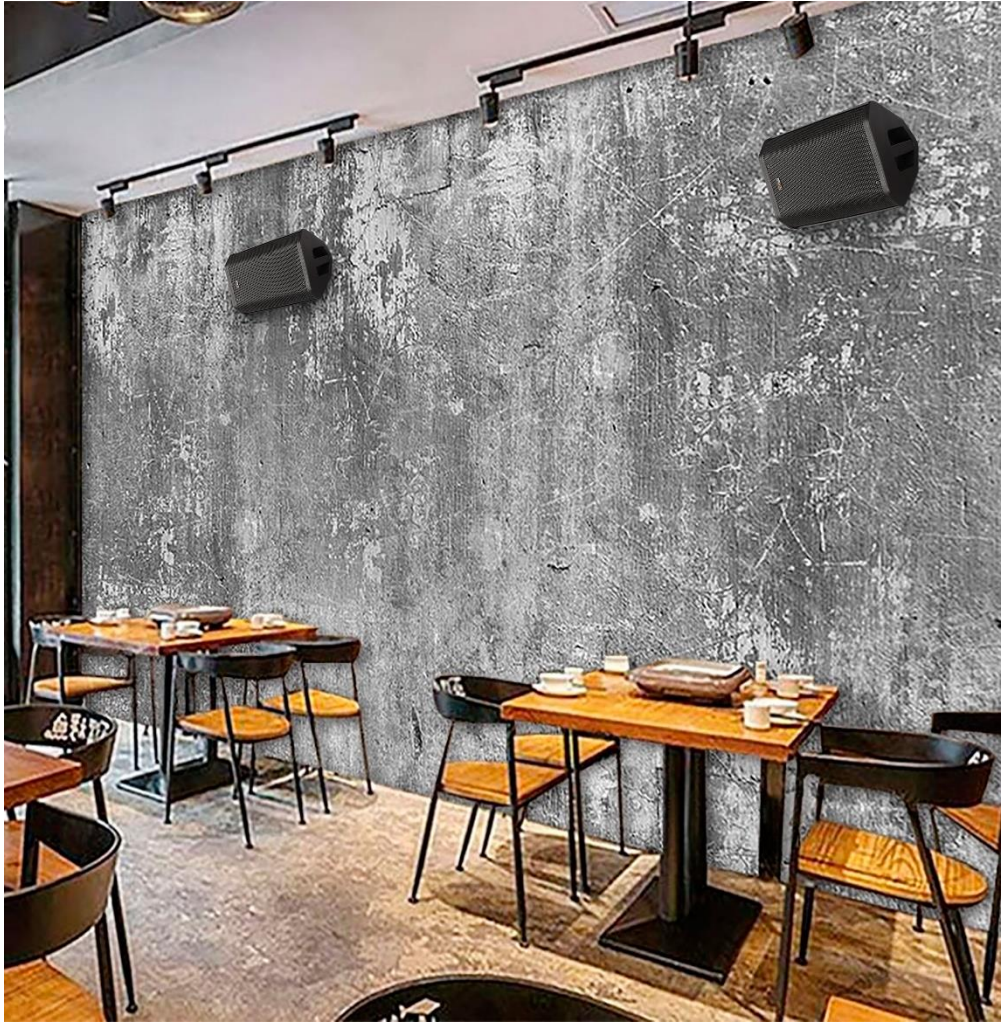
Bracket for wall or ceiling installation