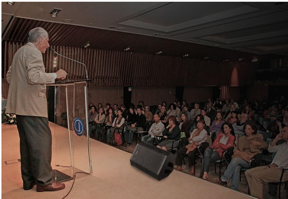
Floor monitor (45° angle)