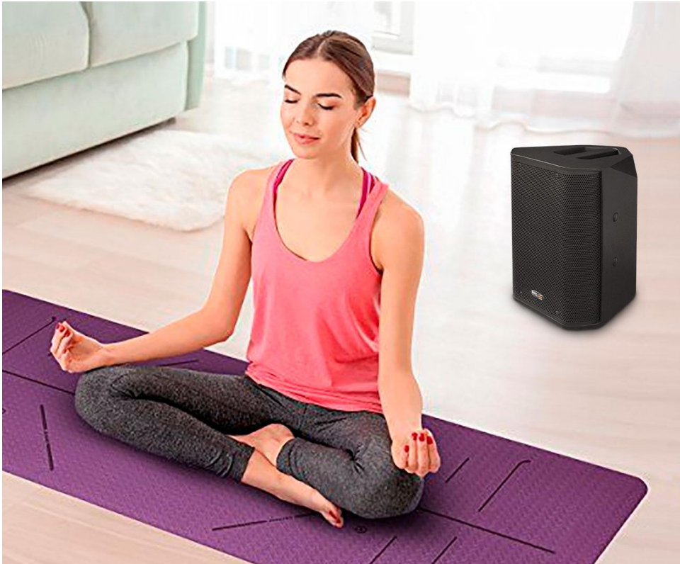
On the floor

The acoustic enclosure of i 601 A has been designed to offer a wide variety of installation possibilities.